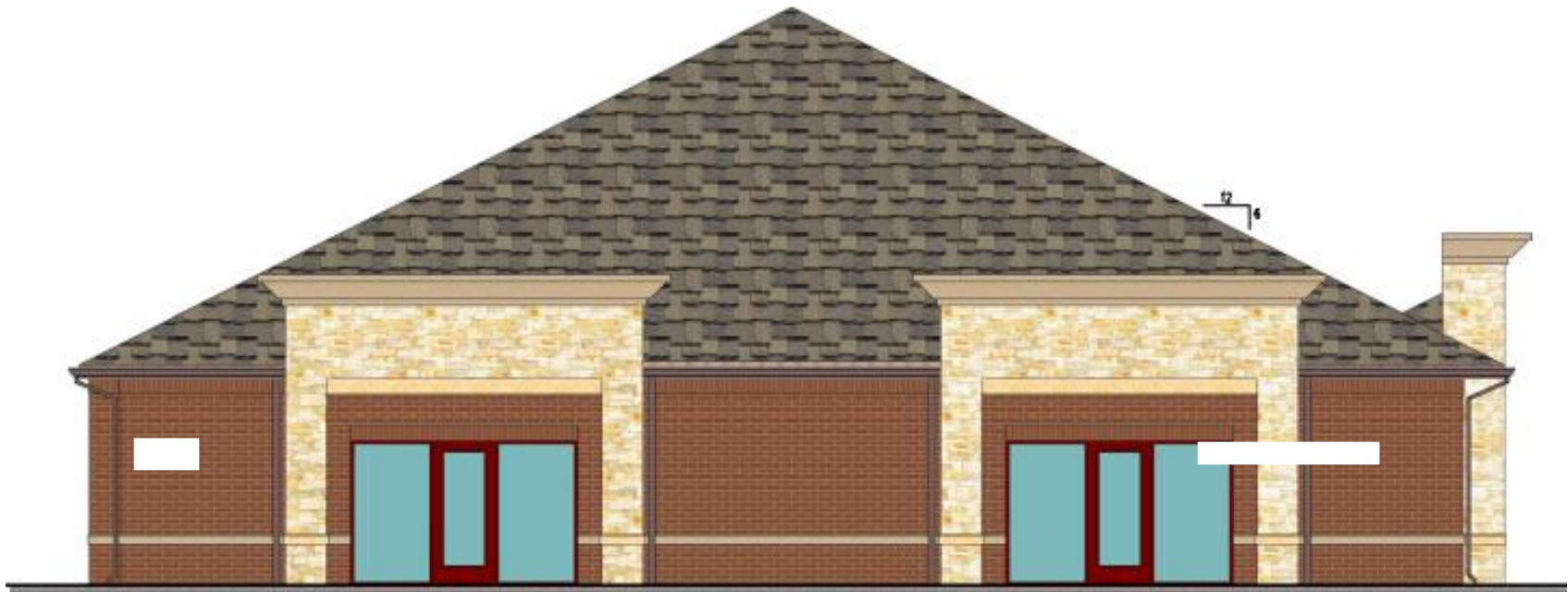
EAST & WEST Elevation